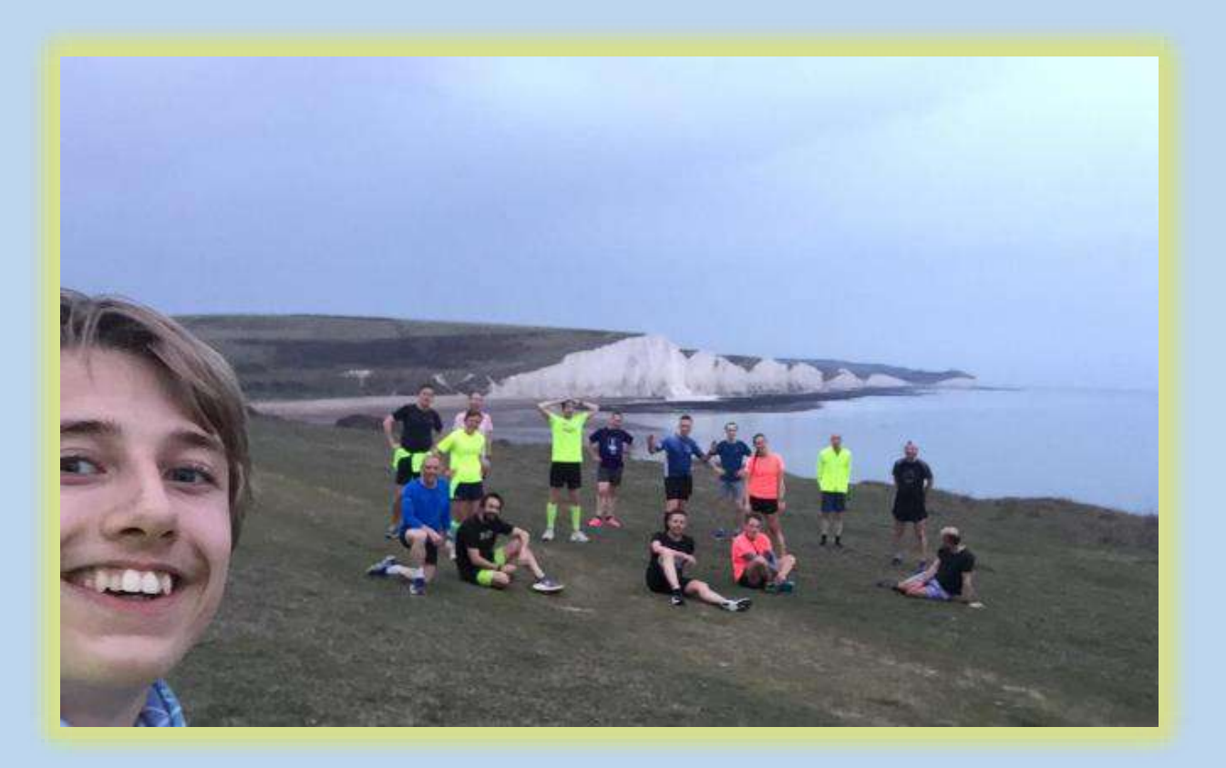
What a wonderful evening- four fantastic groups of people that make up one fantastic running club.