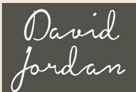
Seaford Estate Agents Tel: 01323 898414

The club is fortunate to receive sponsorship from the following local organisations and it is because of their support that the club can offer a free vest or tee shirt to new members and subsidised kit to all members. Seaford Striders would be delighted to add more sponsors to its band of supporters. If anyone knows of other local companies who would be interested in sponsoring Seaford Striders, then please do get in touch. Thank-You.